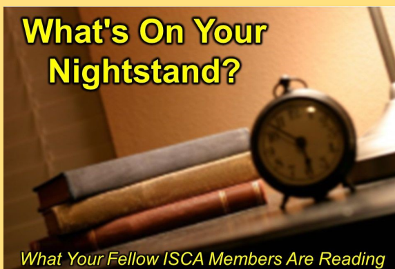
What Your Fellow ISCA Members Are Reading